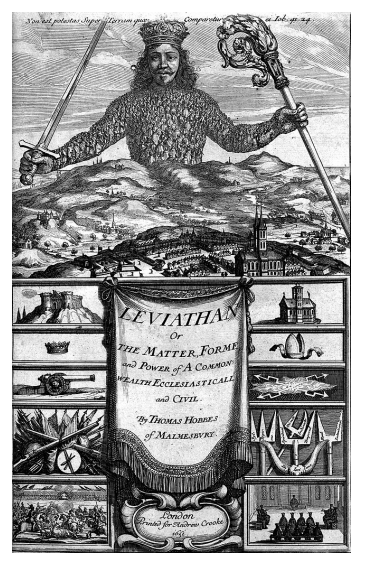
Fig. 2 The title page of Thomas Hobbes' 1651 Leviathan

The sovereign produces and guarantees the situation in its totality. He has the monopoly over this last decision. Therein resides the essence of the state's sovereignty, which must be juristically defined correctly, not as the monopoly to coerce or to rule, but as the monopoly to decide. The exception reveals most clearly the essence of the state's authority. The decision parts here from the legal norm, and (to formulate it paradoxically) authority proves that to produce law it need not be based on law.<sup>22</sup>