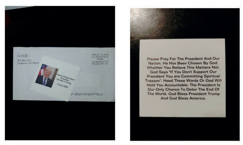
Anonymous letter received in the mail during the 2020 presidential election.

"God's Chosen One" and that he "Is Our Only Chance To Deter The End Of The World." As is standard in religious cults, the letter even attempted to engage in spiritual manipulation by writing, "God Says 'If You Don't Support Our President You are Committing Spiritual Treason'."